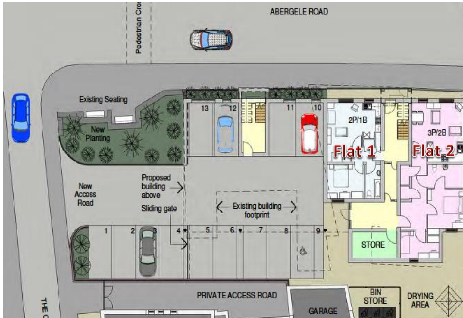
Site Plan (not to scale)